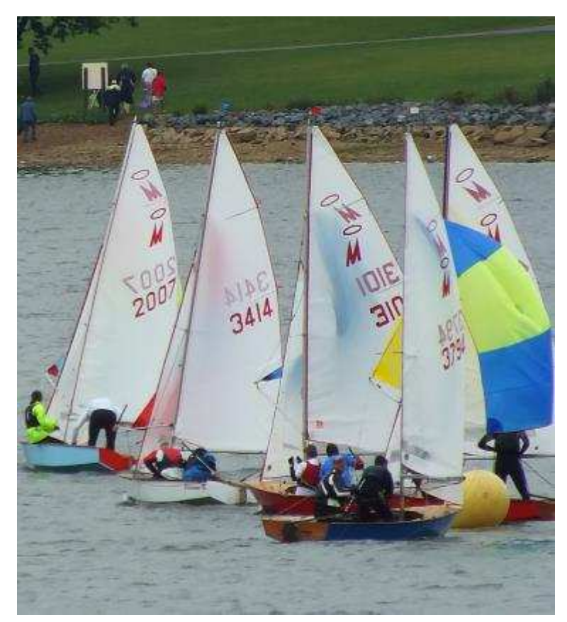
A crowd at Rutland Nationals